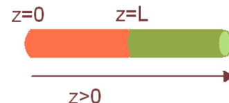
Fig. 1. (Color online) Arbitrary field created at z=0 and propagated through a first GRIN medium, z \leq L (left side), and a second GRIN medium, z > L (right side).

The function k^2(x, y, z) may be written as