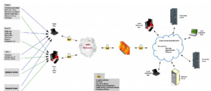
Figure 2. Electronic public health structure.

In general terms, a public health system on-line, based in an electronic medical file (see Figure 2), would prompt the existence of an electronic public health network simplifying the flow of information between the different players involved: patients, doctors, medics, nutritionists, psychologists, technical staff and support management, epidemic control centre, research centres, among other.